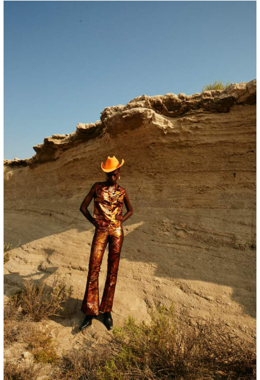
LOOK # 1 . CLT01 Jacquard corset Top / PT03 Slim Fit pants