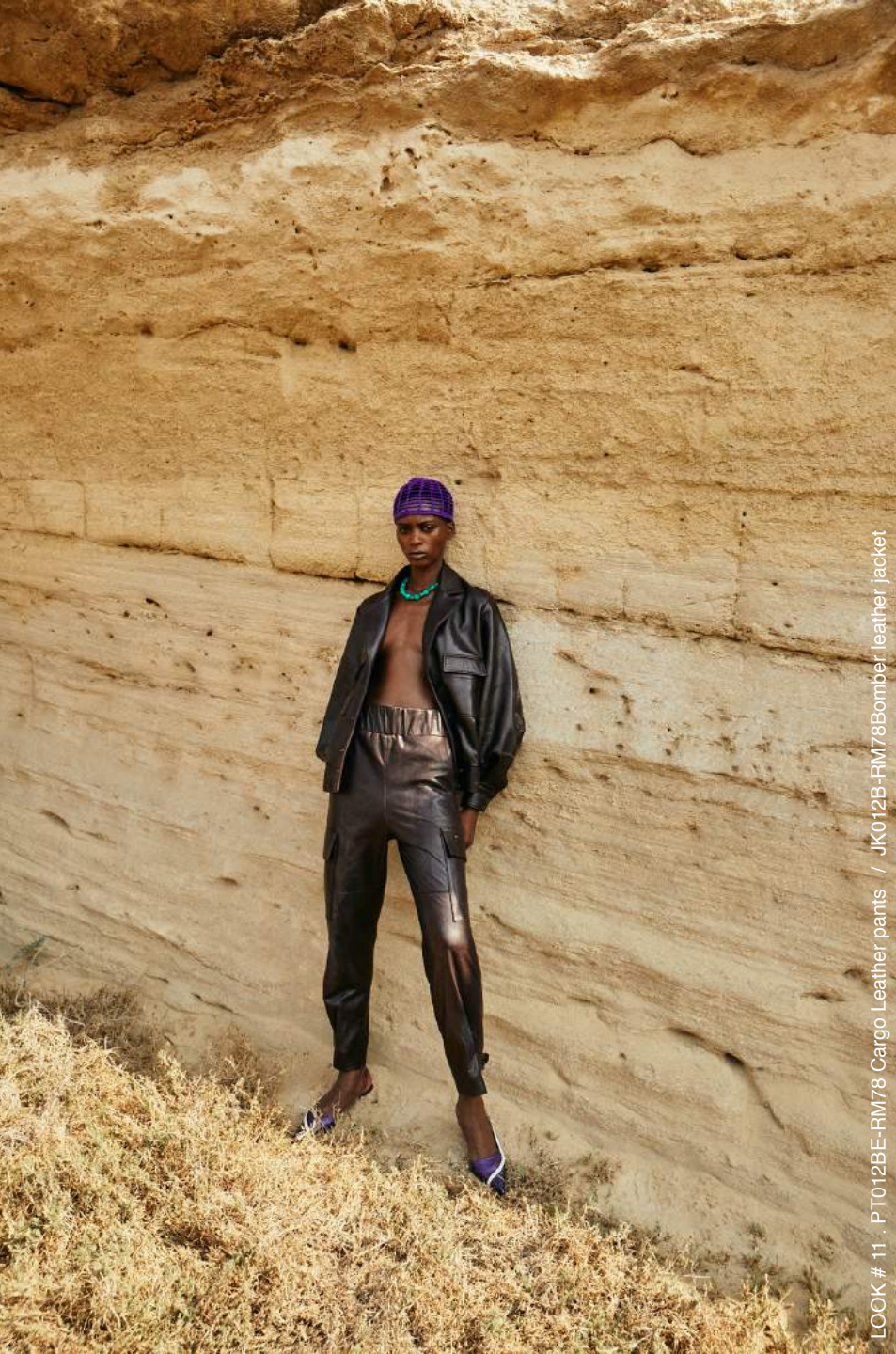
LOOK # 11 . PT012BE-RM78 Cargo Leather pants / JK012B-RM78 Bomber leather jacket