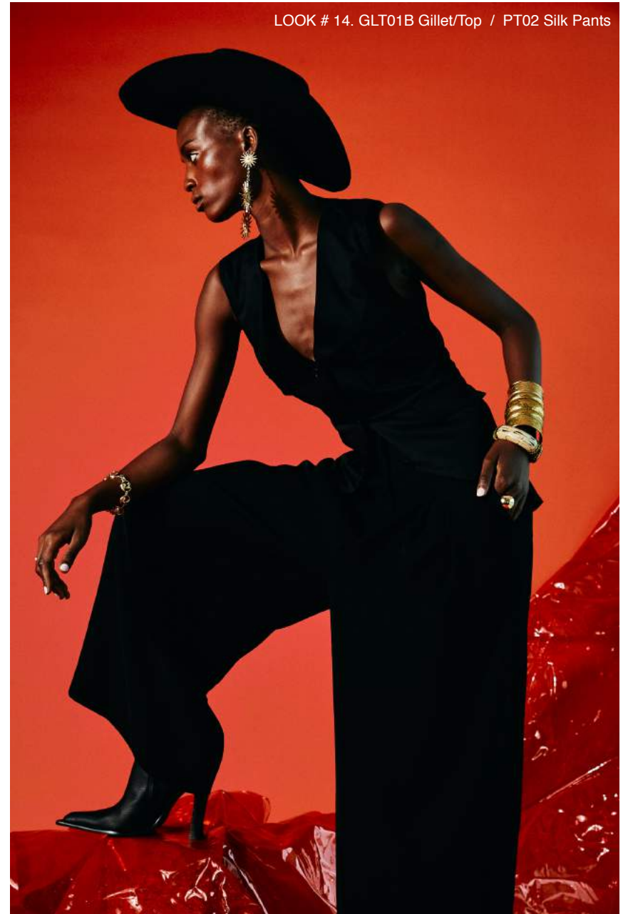
LOOK # 14. GLT01B Gillet/Top / PT02 Silk Pants