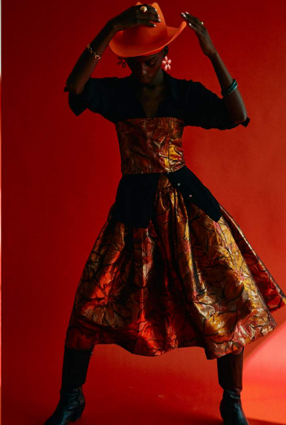
LOOK # 19 . CLT01 Jacquard corset Top / SK01 Skirt Ampia