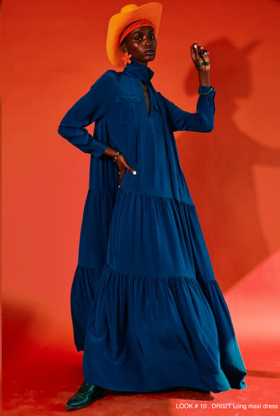
LOOK # 10 . DR02T Long maxi dress