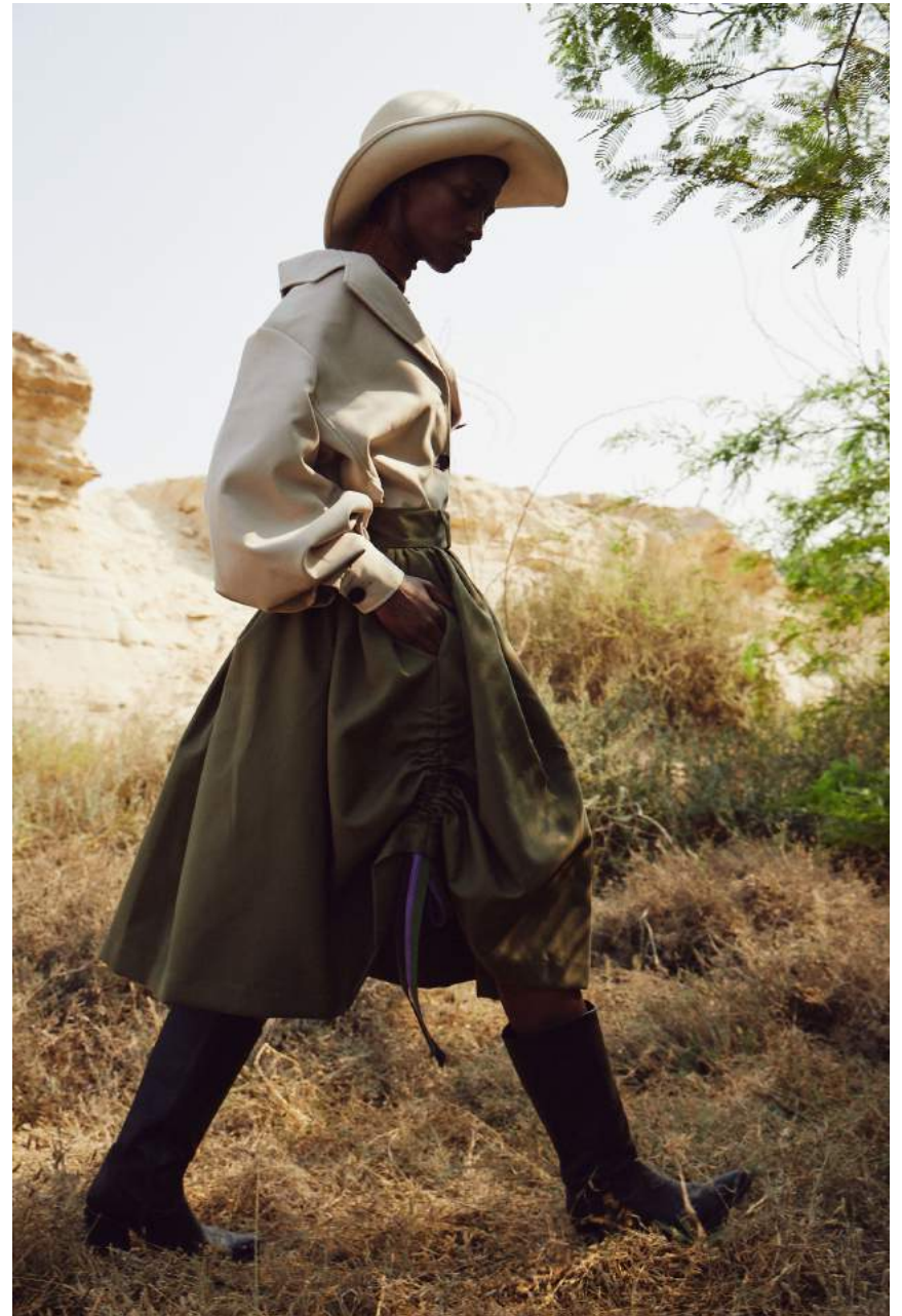
LOOK # 8 . JK01B Drill bomber jacket / SK02 Midi Skirt Coulisse