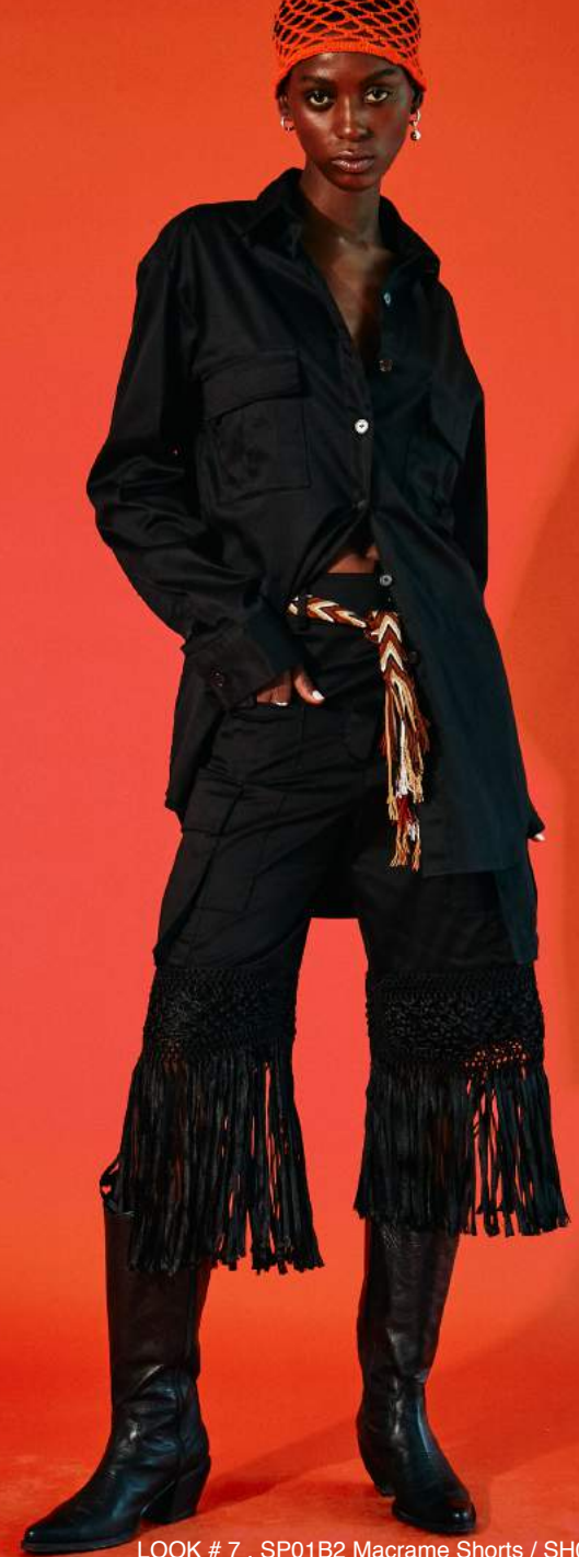
LOOK # 7 . SP01B2 Macrame Shorts / SH03COT01 Macrame Shirt