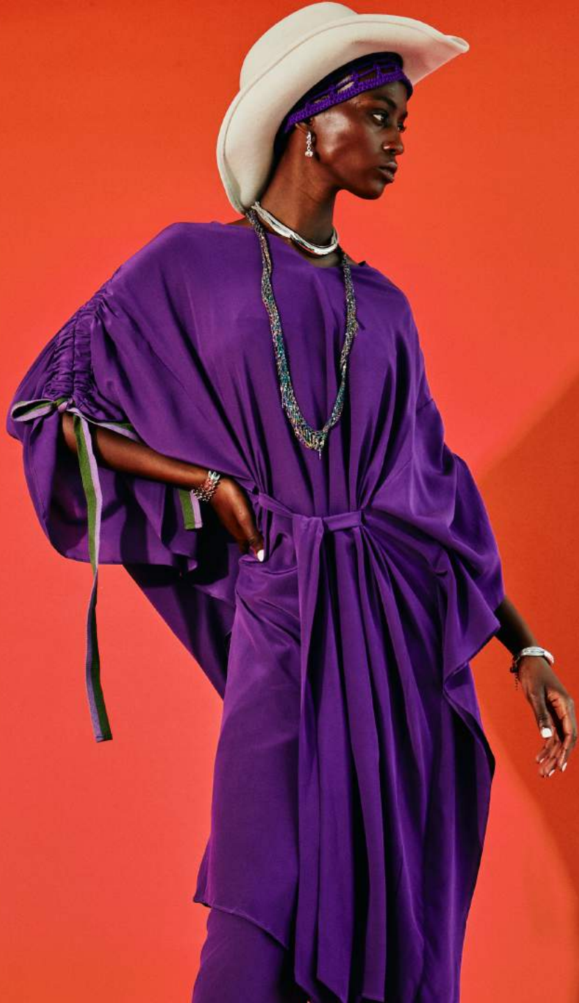
LOOK # 15. DR03 Silk Maxi Dress / PT02 Silk Pants