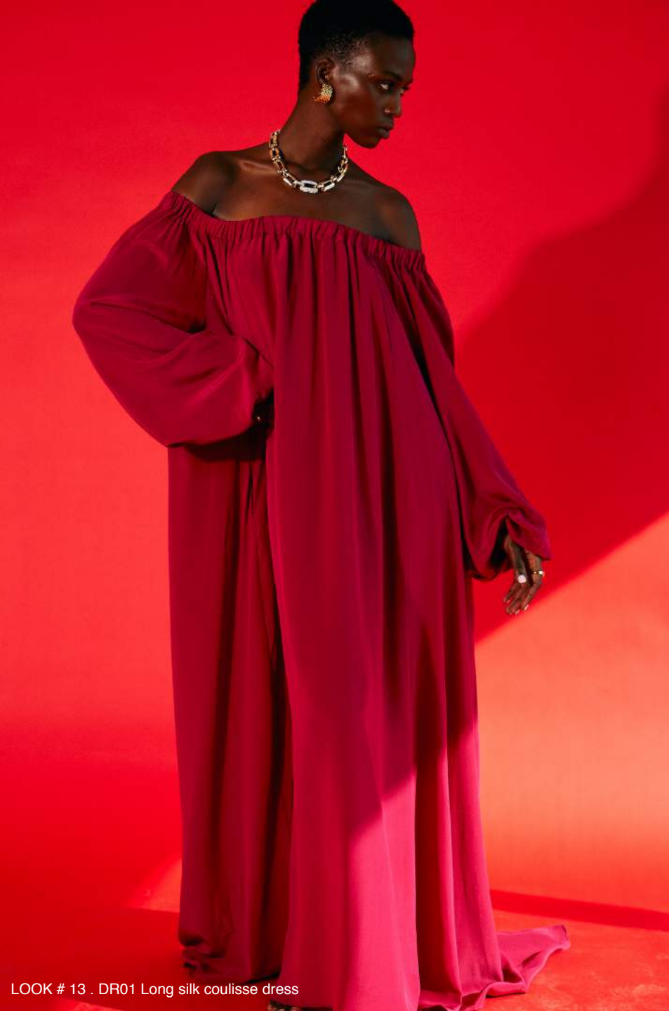
LOOK # 13 . DR01 Long silk coulisse dress