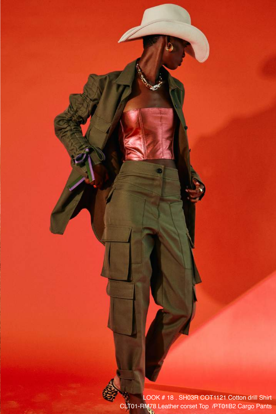
LOOK # 18 . SH03R COT1121 Cotton drill Shirt CLT01-RM78 Leather corset Top /PT01B2 Cargo Pants