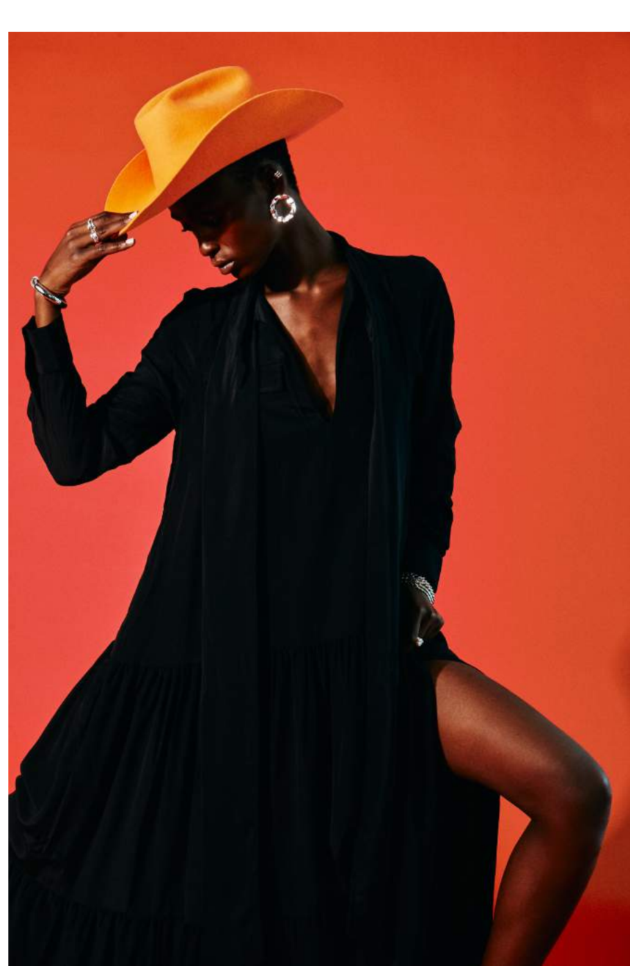
LOOK # 17 . DR02T Long Maxi dress