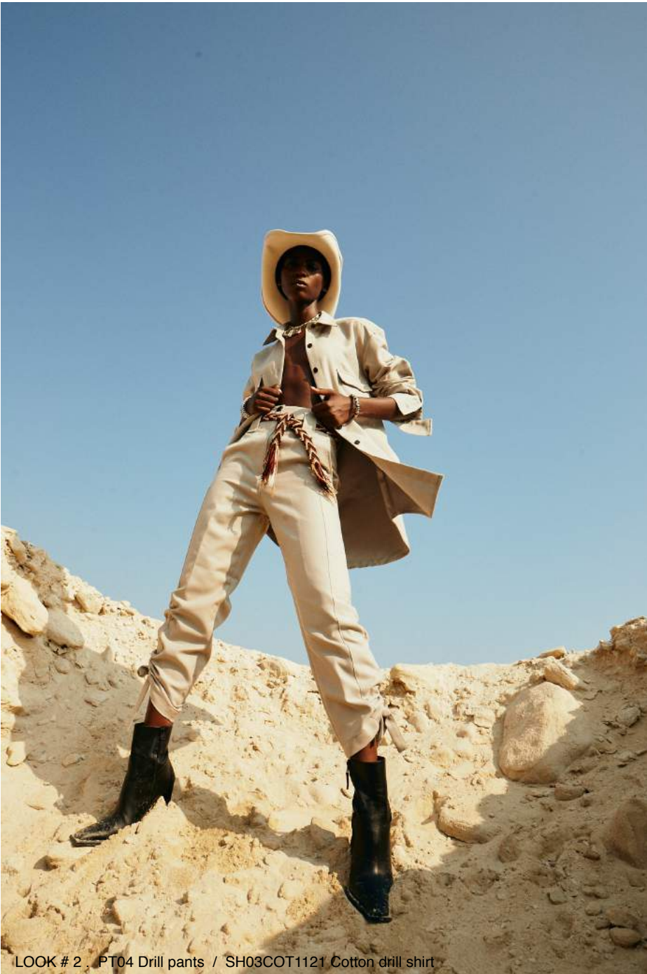
LOOK # 2 : PT04 Drill pants / SH03COT1121 Cotton drill shirt