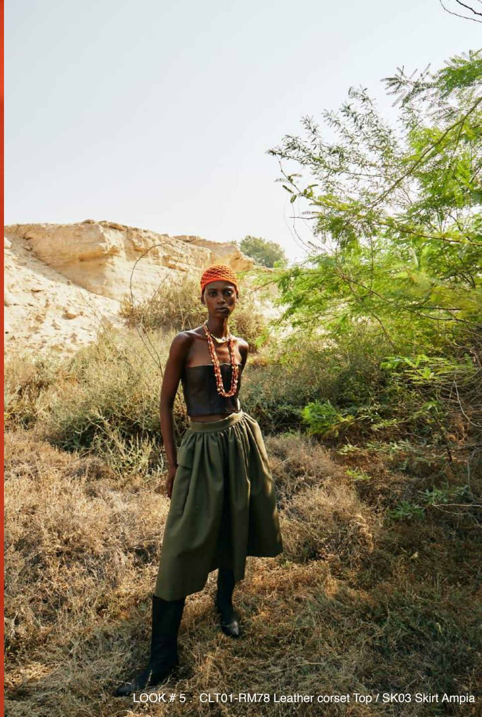
LOOK # 5 . CLT01-RM78 Leather corset Top / SK03 Skirt Ampia