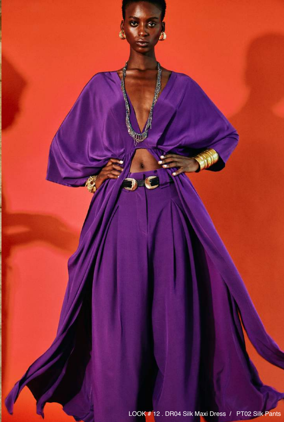
LOOK # 12 . DR04 Silk Maxi Dress / PT02 Silk Pants