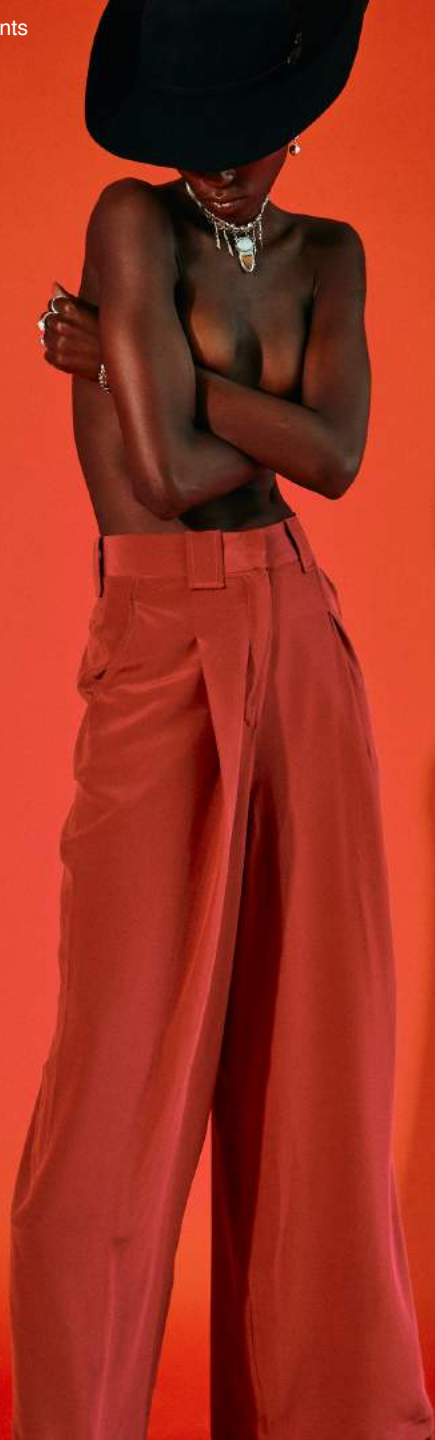
LOOK # 6 . PT02 Silk Pants