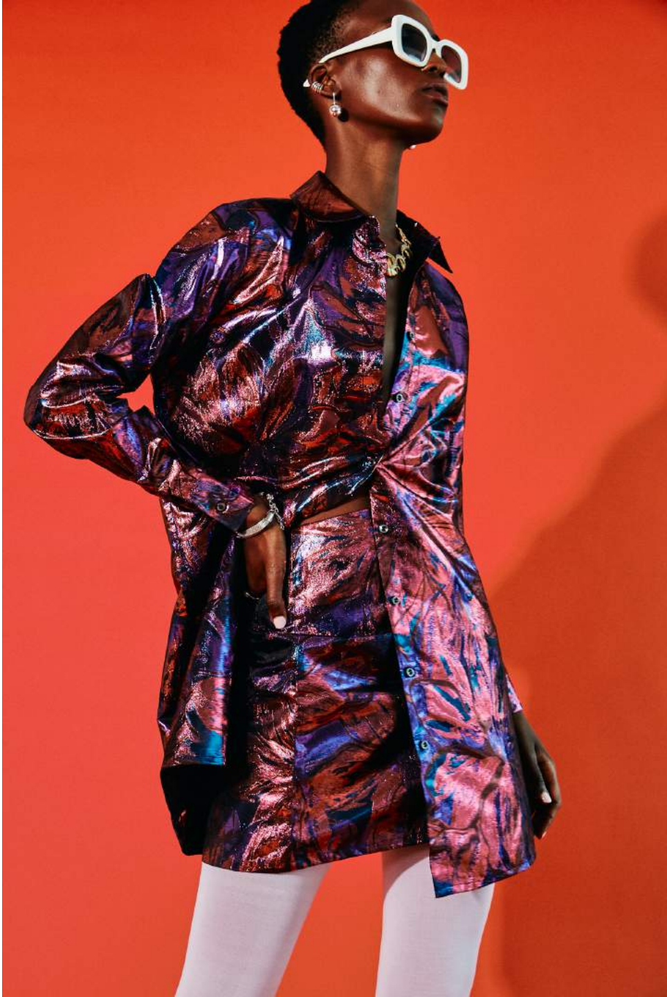
LOOK # 20 . SH04 Shirt / SK03 Mini skirt