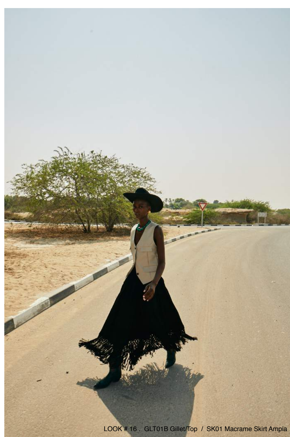
LOOK # 16 . GLT01B Gillet/Top / SK01 Macrame Skirt Ampia